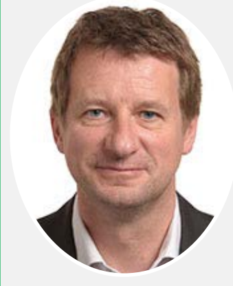
Yannick Jadot (France)