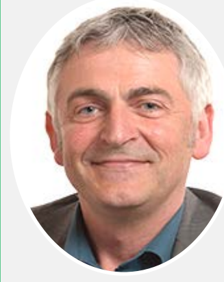
Martin Hausling (Germany)