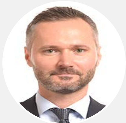
Jaroslaw Walesa (Poland)