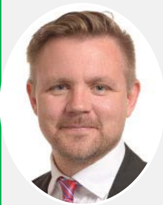
Fredrick Federley (Sweden)