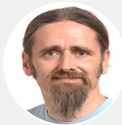
Luke Ming Flanagan (Ireland)