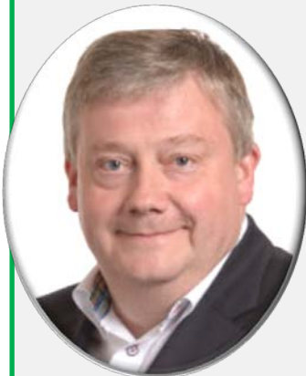
Marc Tarabella (Belgium)