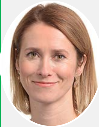
Kaja Kallas (Estonia)