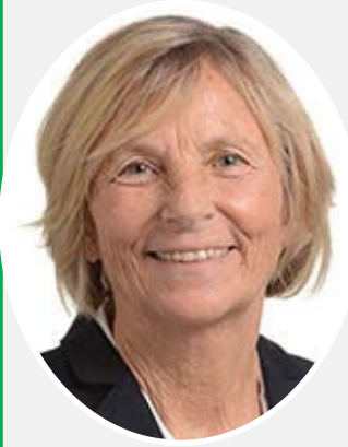
Marielle de Sarnez (France)